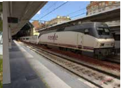
Valencia Train Station, Spain