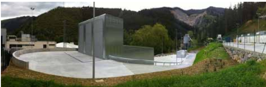
Recycling Center at Debarrena - San Sebastian, Spain