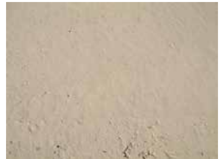
Factory Floor Slab, Bristol. England.